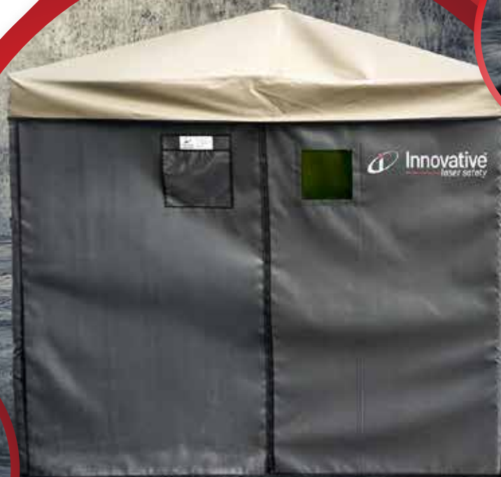
Innovative Laser Barrier LaserArmor 360

Designed for elite performance, the LaserArmor 360 is the ultimate portable laser welding barrier. Its exclusive pop-up design, interchangeable windows for ultimate flexibility, and rugged construction make it the perfect choice for professionals who demand safety and convenience.